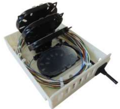
Splicing only (48 splices, only fibres G.657 a, b)