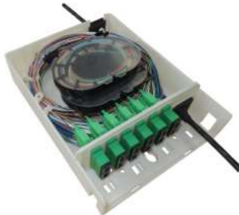
Patching with covered adaptors (24 splices, only fibres G.657 a, b; 6xSC duplex)