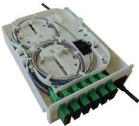
Splicing or patching (24 splices: 6x SC duplex)